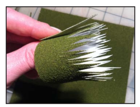
Glue ends together and hold in place until dry