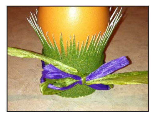
Add decorative ribbons or beads to finish